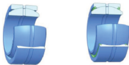
Sliding contact surfaces: Steel / Steel